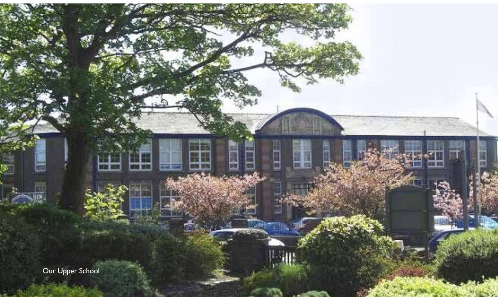
Our Upper School

The Upper School (Ballaquayle site) was built and completed in 1927 in what was then Outer Douglas. Now it is based within the town boundary. The Upper School is home to students in Key Stage 4 and our Sixth Form. Although an older building the excellent facilities have been regularly upgraded and our students benefit from the many specialist rooms required to be successful in the courses we run at the school. These include specialist technology workshops, food technology and textiles rooms; science laboratories; fully equipped computer rooms; drama studio; Sixth Form Hub; Progress Zone; Special Unit; gym weights room and sports hall.