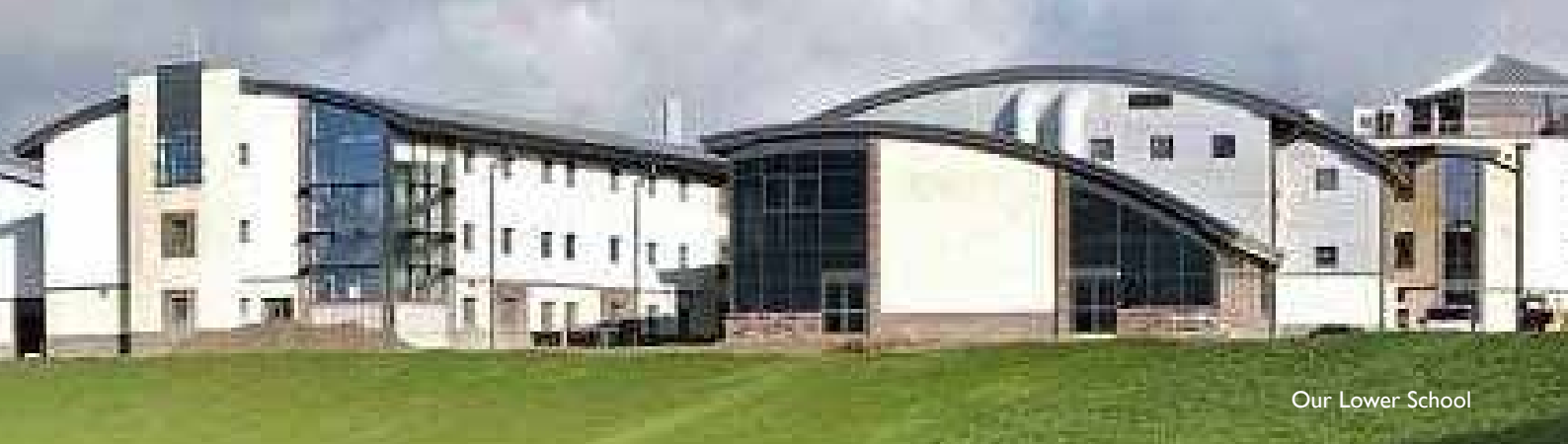
Our Lower School