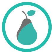
Pear Tree High School Specialist Secondary